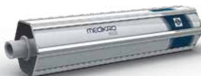
MEDIKRO® Calibration Syringe